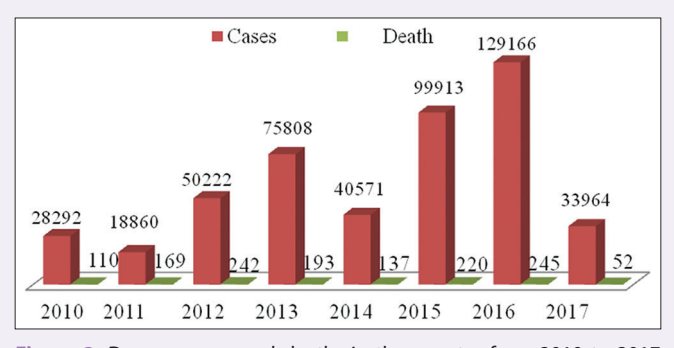
Figure 2: Dengue cases and deaths in the country from 2010 to 2017 (National Vector Borne Disease Control Programme)

Nowadays, it has been noted that some natural home remedies such as Papaya leaves juice, Giloy, kiwi, and other natural sources have been taken by patients on the recommendation of Ayurvedic practitioner to increase the blood platelet counts.<sup>[46]</sup> At present, no vaccines and no effective treatment against dengue are available. Therefore, our focus is on the extract of medicinal plants which may be more effective, safer, and less toxic than synthetic drugs. It is the time to scientifically isolate