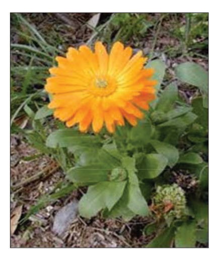
Figure 1: Calendula officinalis L

C. officinalis preparations currently in use include carophyllenic ointment (containing carotenoids extracted from the flowers) and pot marigold tincture. It is one of the constituents of proprietary homoeopathic medicine Traumeel*, used for treating the symptoms associated with acute musculoskeletal injuries including pain and swelling. Otikon otic solution and naturopathic herbal extract ear drops solution, ear drop formulations of naturopathic origin containing Calendula flowers, have been reported to be effective for the management of otalgia associated with acute otitis media in children. [23,24]